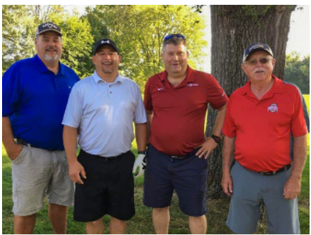
1st Place: Mutual Federal

3rd Annual Drive for Scholarships JULY 30,2021