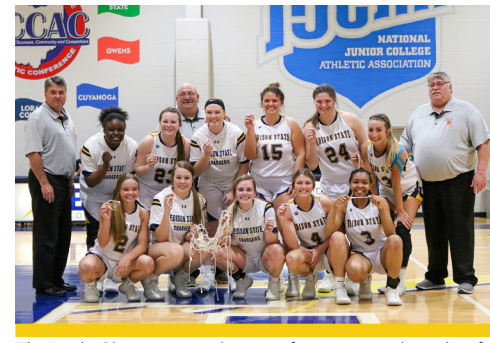
The Lady Chargers cut the net after earning the title of Co-League Champions in 2020

Eight basketball players were named recipients of post-season awards from the OCCAC for the 2019-20 season. Representing the women's team: