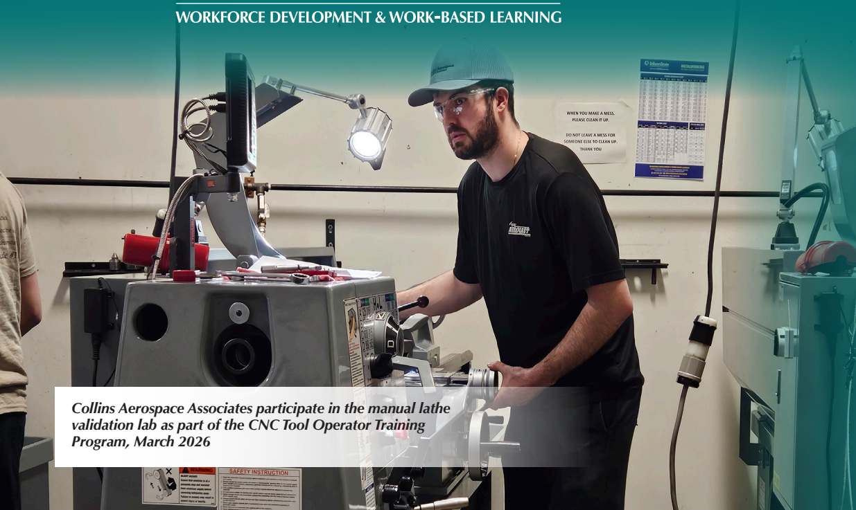
Collins Aerospace Associates participate in the manual lathe validation lab as part of the CNC Tool Operator Training Program, March 2026