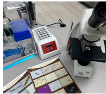
Lab Enhancement for EMS Students $831