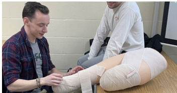
Physical Therapist Assistant (PTA) Student Training Support $1,000