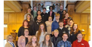
Institute of Management Accountants (IMA) Annual Student Event $820