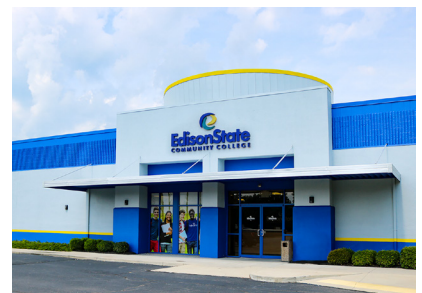
Campus at Troy

At the start of the Fall 2019 semester, the Campus at Troy opened its doors. Edison State at Troy was established to meet the needs of the growing healthcare industry and is positioned to be the center of healthcare education and training for the Upper Miami Valley. The Campus is also host to numerous general education courses and transfer pathways to both in- and out-of-state four-year universities. Edison State at Troy also presents the opportunity for College Credit Plus coursework, and support to regional businesses with response to workforce training and apprenticeship opportunities. A co-location agreement with Franklin University provides students with the opportunity to pursue a bachelor's degree in healthcare beginning at Edison State at Troy and completing at Franklin University utilizing on-site or online courses.