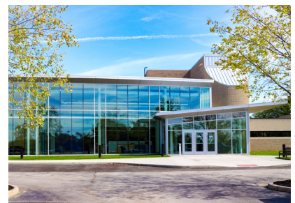
Robinson Student Career Center