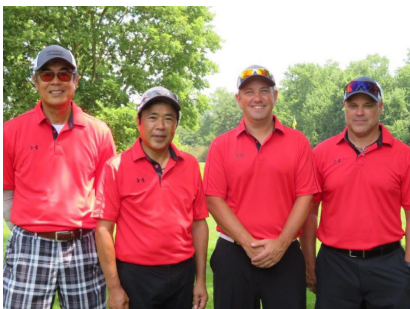
1st Place Team Advanced Composites

All proceeds from the event directly benefited the student scholarship program, which provides Edison State students with the opportunity to attain higher education.