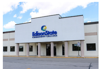
Campus at Greenville

The well-established Campus at Greenville continues to thrive, offering a variety of new program offerings. Edison State at Greenville is home to degree, certificate, and short-term technical certificate career pathways in agriculture. The campus also offers general education courses and transfer pathways to both in- and out-of-state four-year universities. Additionally, Edison State at Greenville presents the opportunity for College Credit Plus coursework, Aspire courses through the Upper Valley Career Center, and support to regional businesses with response to workforce training and apprenticeship opportunities.