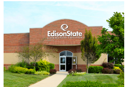
Campus at Eaton

In early 2019, Edison State cut the ribbon to the Campus at Eaton, which currently offers general education and agriculture courses, transfer pathways to both in- and out-of-state four-year universities, as well as degree, certificate, and short-term technical certificate opportunities. Additionally, Edison State at Eaton presents the opportunity for College Credit Plus coursework, Aspire courses, expanded articulation agreements with Miami Valley Career Technology Center, and support to regional businesses with response to workforce training and apprenticeship opportunities.