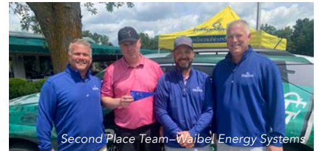
Second Place Team—Waibel Energy Systems