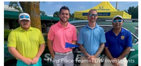
Third Place Team—TDW Investments