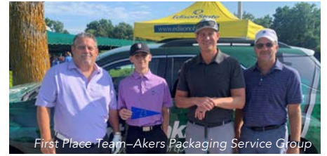
First Place Team—Akers Packaging Service Group