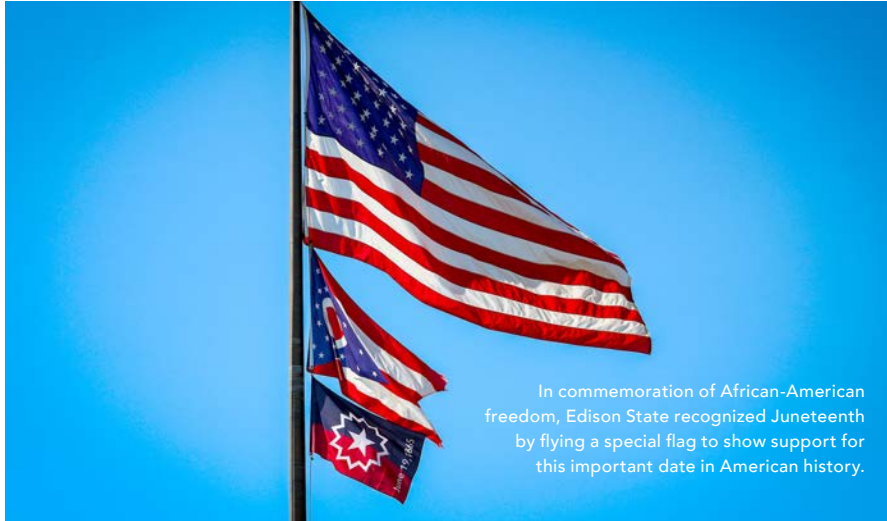
In commemoration of African-American freedom, Edison State recognized Juneteenth by flying a special flag to show support for this important date in American history.