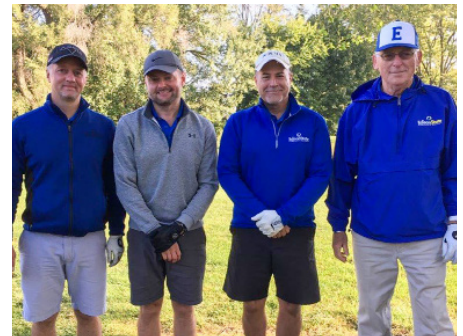
3rd Place: Edison State Community College