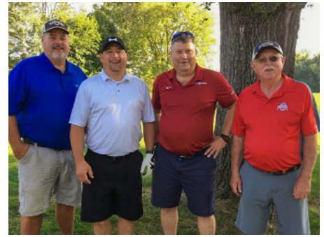
1st Place: Mutual Federal

3rd Annual Drive for Scholarships JULY 30, 2021