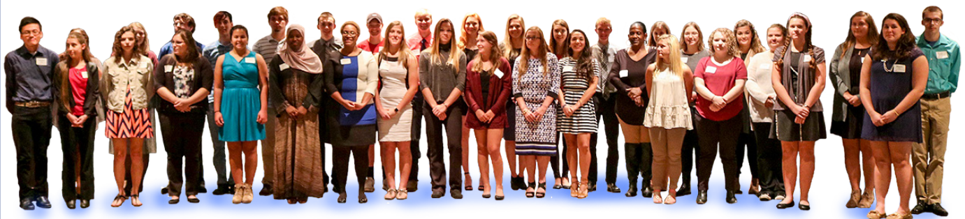
2017 Scholarship recipients

Founded in 1993, the Edison Foundation has raised millions of dollars, primarily given through scholarships to Edison State students. For more information about the Edison Foundation and scholarship opportunities, visit www.edisonohio.edu/Foundation .