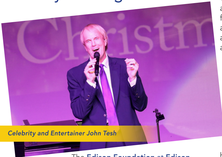
Celebrity and Entertainer John Tesh

The Edison Foundation at Edison State Community College held its 20th annual Holiday Evening on Wednesday, November 29, to help raise money for student scholarships. The evening featured John Tesh as the headlining entertainment for the night.